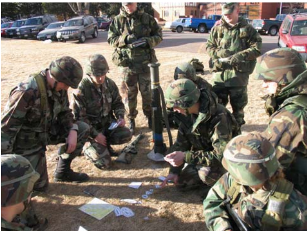
Cadets practice essential skills such as disseminating an oporder during lab.

Lab is preparing us for our future as officers in the Army by instilling confidence in us in a way that we all enjoy.