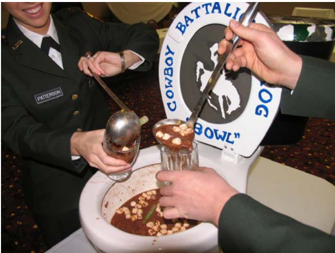
Cadets charge their glasses in preparation for the opening toasts.