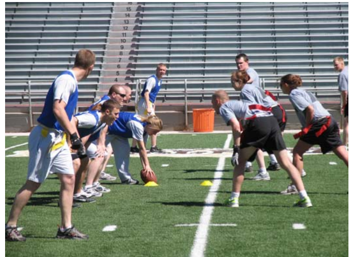
Army and Air Force cadets square off in a game of flag football.

After a lunch of pizza and sub sandwiches provided by Air Force ROTC, the Army had fun fighting the wind to upset Air Force in ultimate Frisbee, but as Air Force usually does, they beat Army 3-0 in 3 Ball Soccer. With Army and Air Force neck and neck, a last minute surprise and morale booster, came when the teams were allowed to use War Memorial Stadium